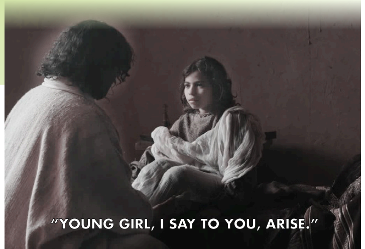
"YOUNG GIRL, I SAY TO YOU, ARISE."

For an idea of how this author sees the wicked and the spiritual death that is their lives, read the verses in between the selection that is our reading (that is, 2:1-22). Part of this text forms the Old Testament reading for the 4th Friday of Lent. The presence of reported speech in this section suggests to some that the author is quoting the words of his adversaries and that the book is partly the product of an intense and at times hostile